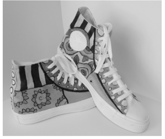
Artist Maria Hoover

Items could include scarves, flip-flops, earrings, bracelets, pins, necklaces, t-shirts, tank tops, shawls, reading glasses, aprons, masks, belts, socks, hats, shoes, handbags, etc., etc., etc. If you can wear it, and it's creative and fun, it's exactly what we're looking for!